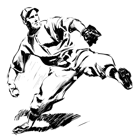
She kept running away from the ball!

Why didn't Cinderella make the baseball team?