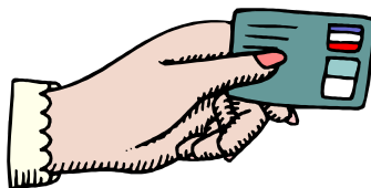
They both give you a charge!

Why is touching an electric wire like using a credit card?