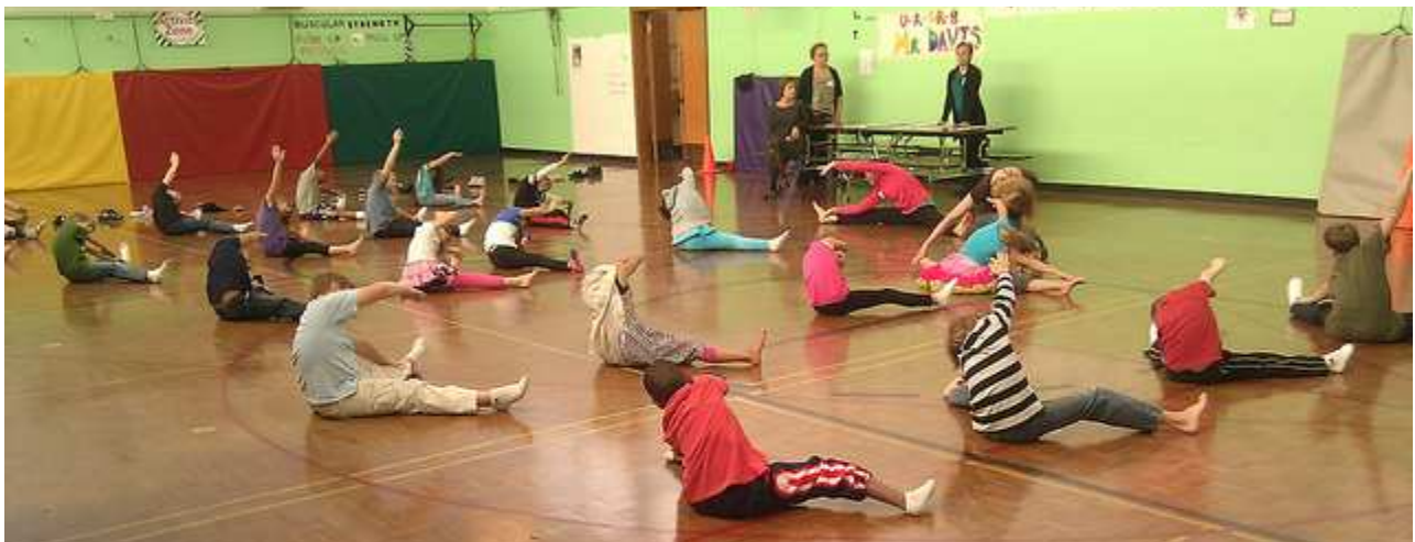
Third graders try out for Dance Chance with the Pacific Northwest Ballet!