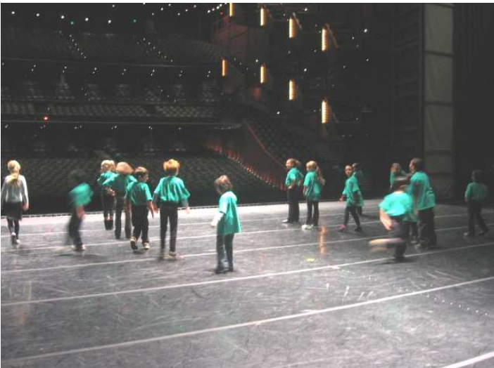
2<sup>nd</sup> graders warming up for their DISCOVER DANCE performance on Nov. 14 at McCaw Hall!