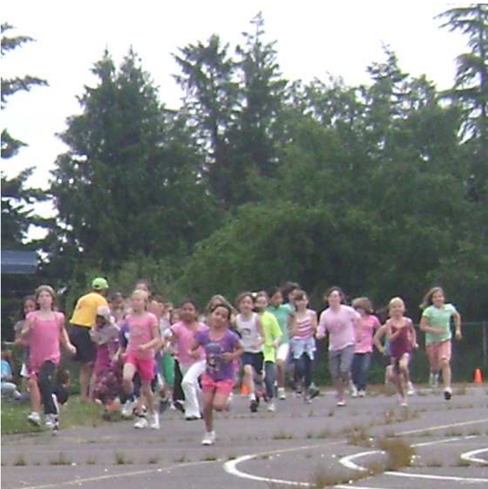
Mile Run—Boys' start!