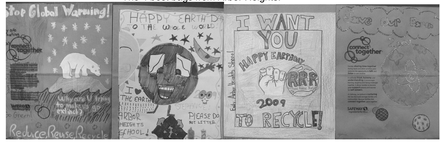
The 4 best bags from Arbor Heights!