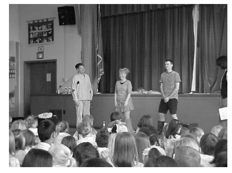
Young Author's Day: My Father's Dragon and signing shirts! More pictures at www.arborheights.com