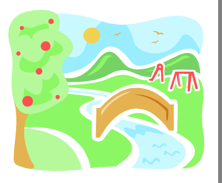
Because it has two banks!